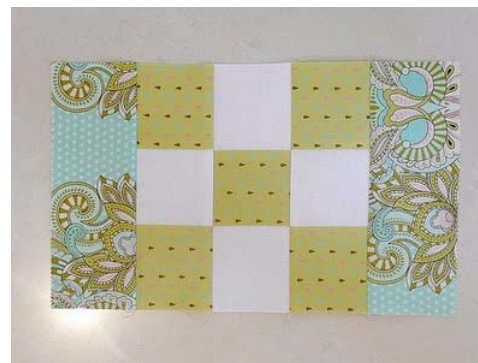
Sew a 6.5" border strip to either side of a nine-patch.