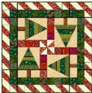
Candy Stripe Border