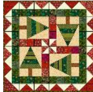
Flying Geese Border