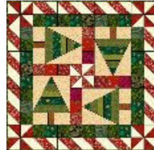
Candy Cane Lane

These are bare-bone directions, assuming that you know the basics in quilting.