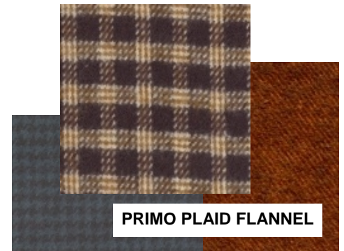
PRIMO PLAID FLANNEL