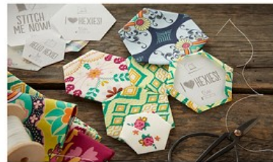
Free hexagon templates