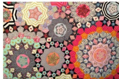
We love: The La Passacaglia quilt