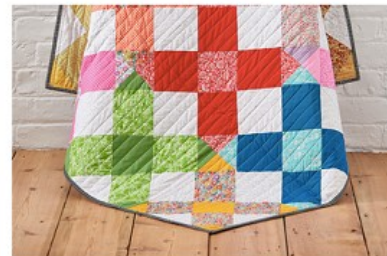
Free project: Liberty Crosses quilt