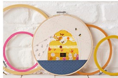
Free FPP bees template