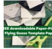
FREE PRINTABLE RESOURCE: PAPER- PIECED FLYING GEESE