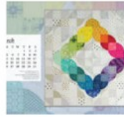
FREE QUILT CALENDAR COMPUTER WALLPAPER: MARCH 2018