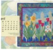
FREE QUILT CALENDAR COMPUTER WALLPAPER: APRIL 2018