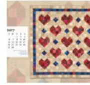
FREE QUILT CALENDAR COMPUTER WALLPAPER: FEBRUARY 2018