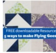
INFOGRAPHIC: 5 WAYS TO MAKE FLYING GEESE WITH THE MATH DONE FOR YOU!