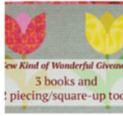
QUICK! IT'S A CURVY GIVEAWAY