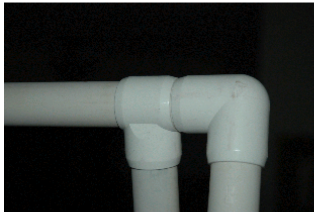
Slip Tee Detail

(See Sources for the Slip Tees and review PVC Pipe Cutting and Gluing Techniques at PVCworkshop.com .)