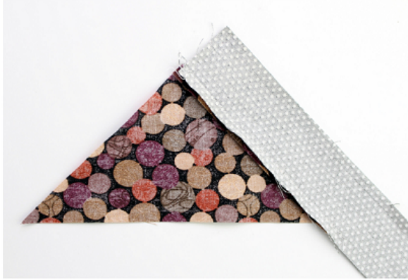
Step 3: Flip and press seam to side toward triangle.