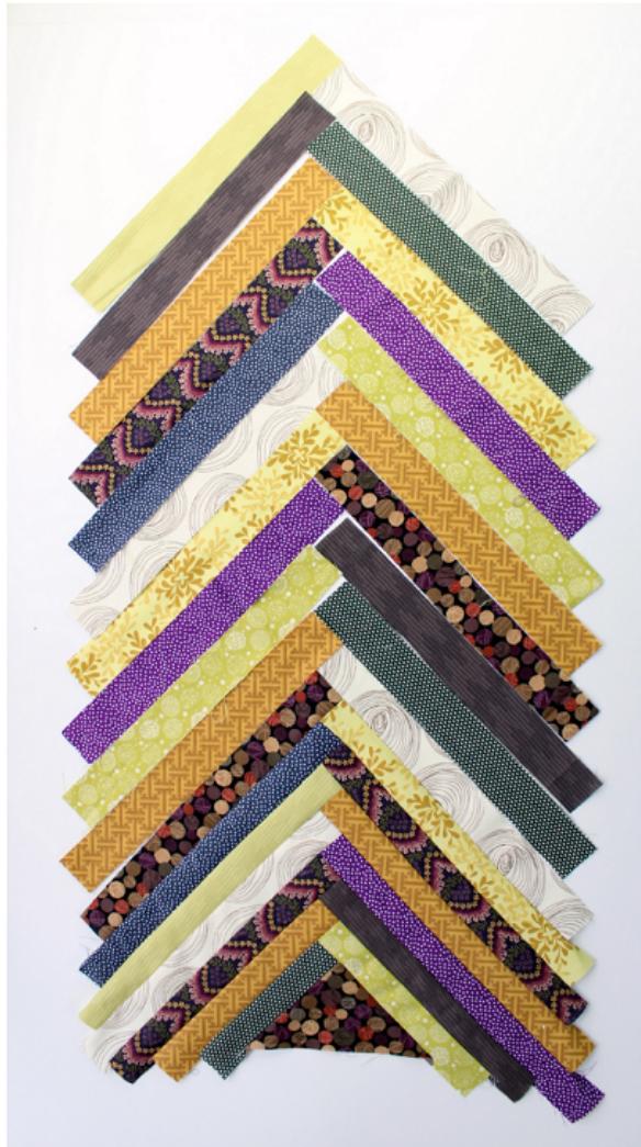
Step 6: On a design wall or flat surface, arrange the remaining strips as desired.