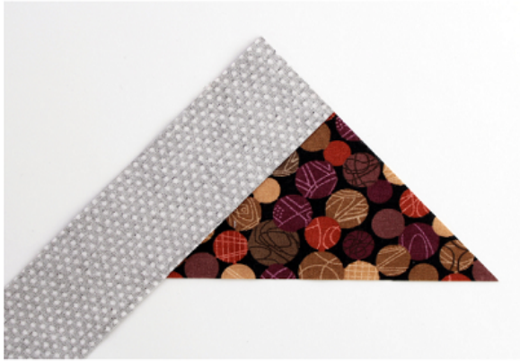
Step 2: Place the cotton triangle (cut using the template on page 6 of the pdf) right side up on a flat surface. Align the first strip on the left edge of the triangle, with right sides together. Stitch.