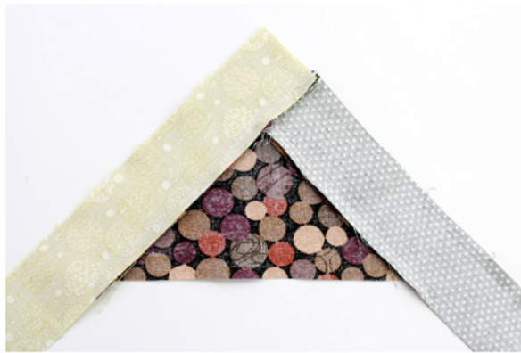
Step 5: Flip and press seam toward triangle.