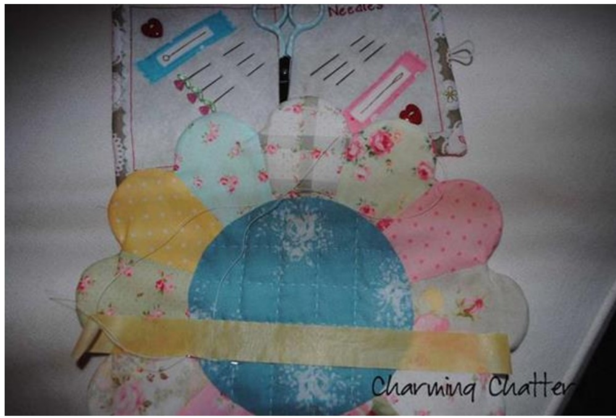
Voila – one very pretty little trivet to brighten up your kitchen.