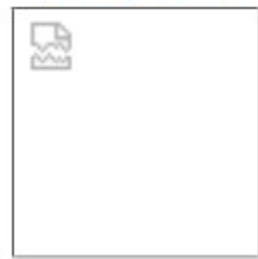
16. Macarons by Nouveau Stitch