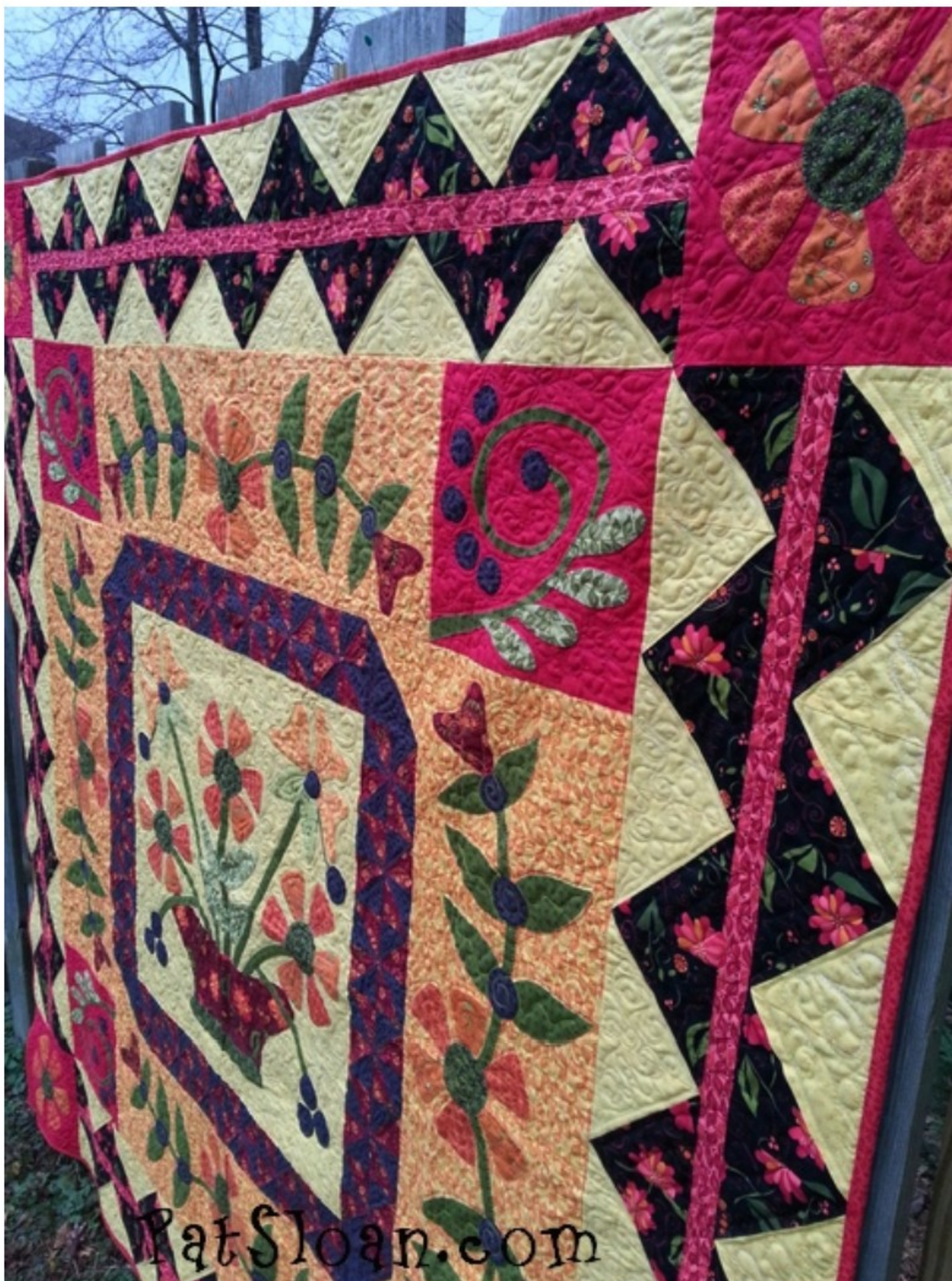
A side view... you can see my quilting swirls