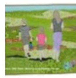
2. Getting Along