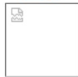
14. a maiden hair fern