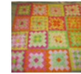
6. Granny Squares